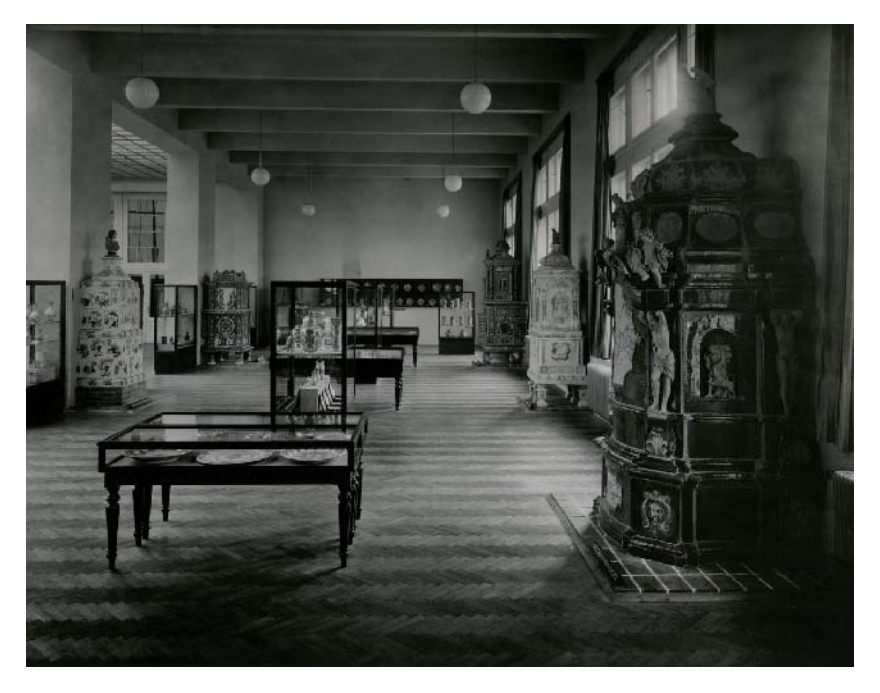
Fig. 7. Glass and china collection, Österreichisches Museum für Kunst und Industrie, 1949