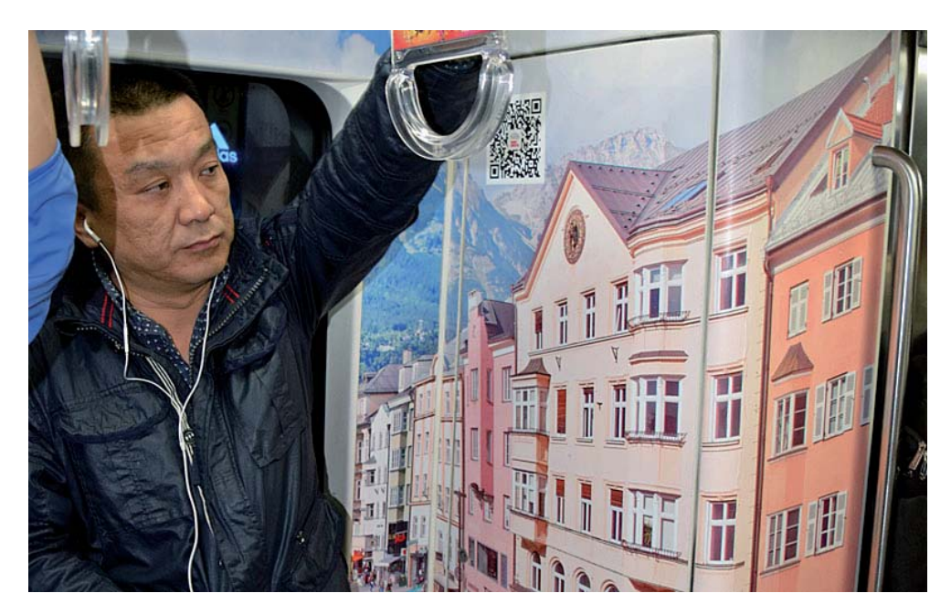
Fig. 4. Österreichisches Museum für Kunst und Industrie, before 1871