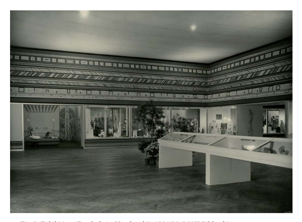
Fig. 2. Exhibition "Das befreite Handwerk", 1934/35