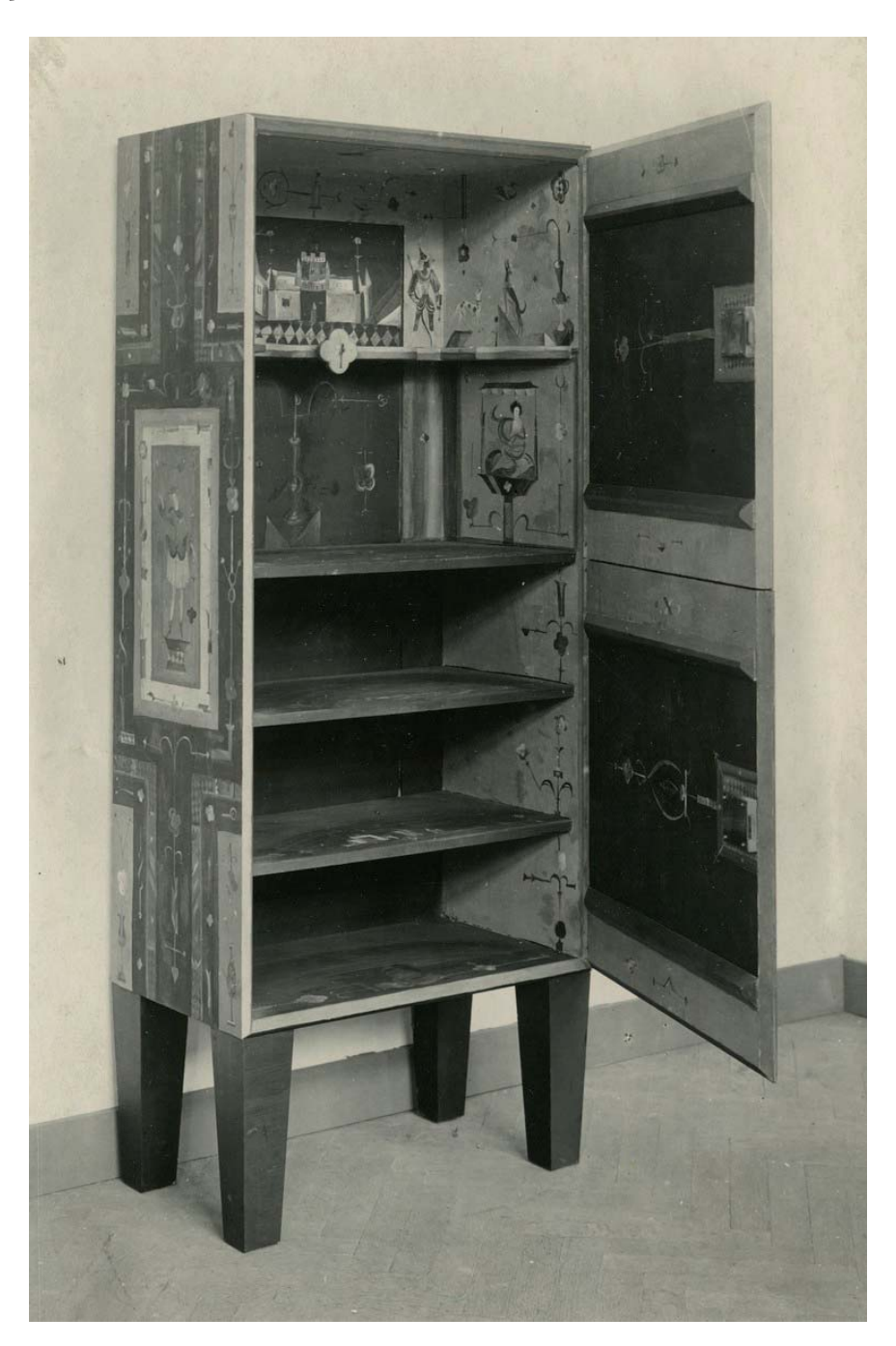
Fig. 1. Cabinet, displayed in the exhibition "Das befreite Handwerk", artist unknown, 1934/35 (MAK-Bildarchiv)