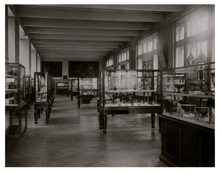
Fig. 8. Glass collection, Österreichisches Museum für Kunst und Industrie, 1916