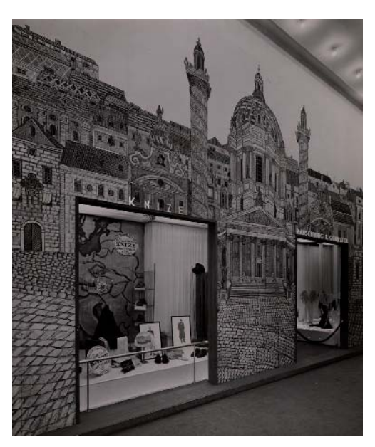
Fig. 3. Exhibition "Austria in London", wallpaper design by Max Frey and Fritz Zülow, Dorland Hall 1934