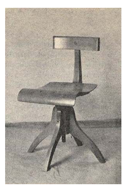
Fig. 5. Chair, displayed in the exhibition "Der gute billige Gegenstand", artist unknown, 1931/32