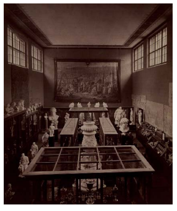
Fig. 6. Österreichisches Museum für Kunst und Industrie, before 1871