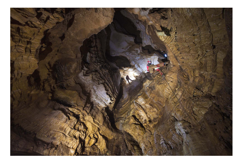
Fig. 3. The so called "Grotta della Lupa" (Roccamorice). The cave was discovered in 2015. It is accessible from the Santo Spirito mine (m 1075 a.s.l.)