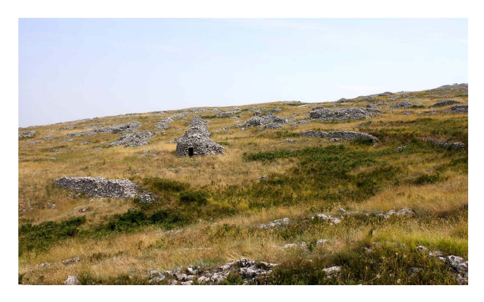
Fig. 7. Agro-pastoral landscape in the area of Roccamorice. The most remarkable features of this landscape are the dry-stone masonry, the tholos huts used by both shepherds and farmers, and the piles of stones removed from the fields