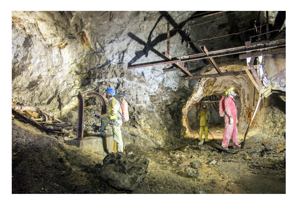
Fig. 6. Pilone mine (Roccamorice). The inside of the abandoned mine