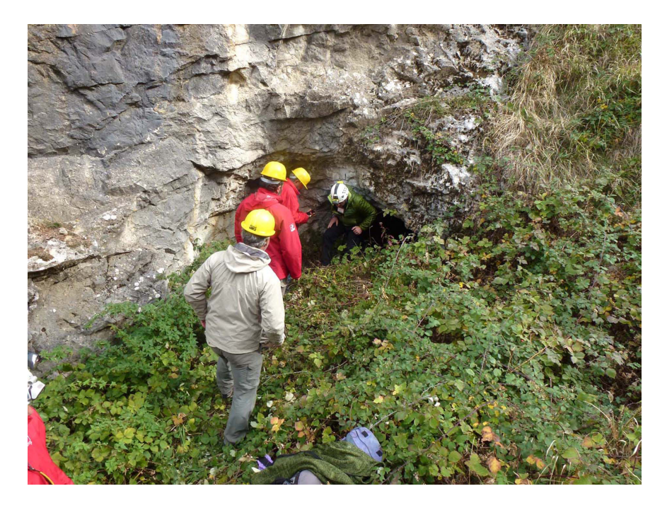
Fig. 2. Acquafredda (Roccamorice). Mine's entry