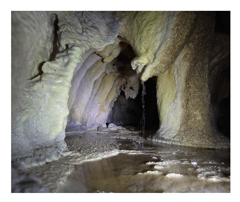
Fig. 4. The so called "Grotta della Lupa" (Roccamorice). The cave is a karst formation of considerable geological and paleontological value