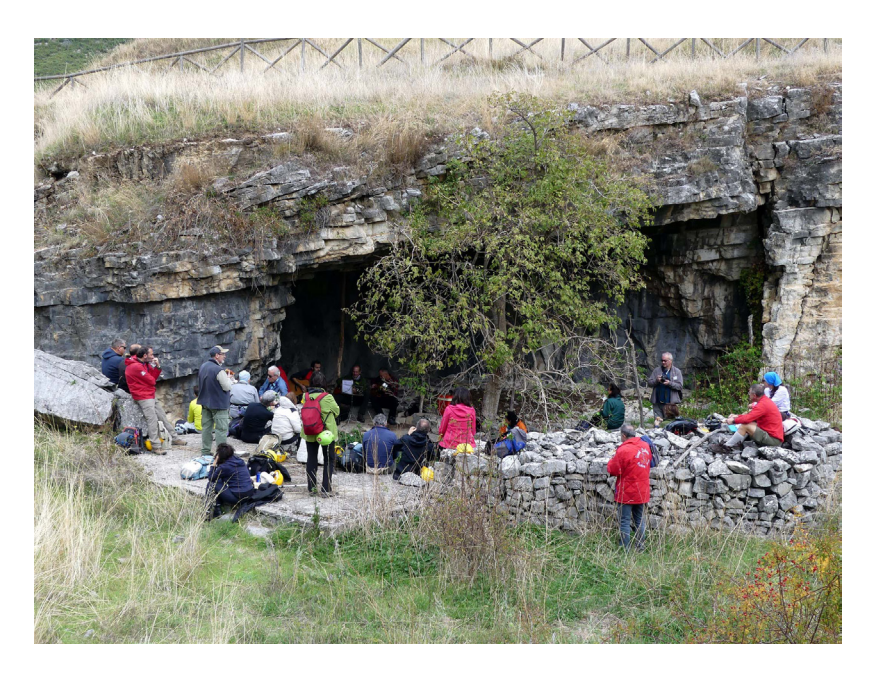
Fig. 8. Excursion to the mining complex of Acquafredda (Roccamorice). The picture shows one of the quarry fronts and dry-stone masonry