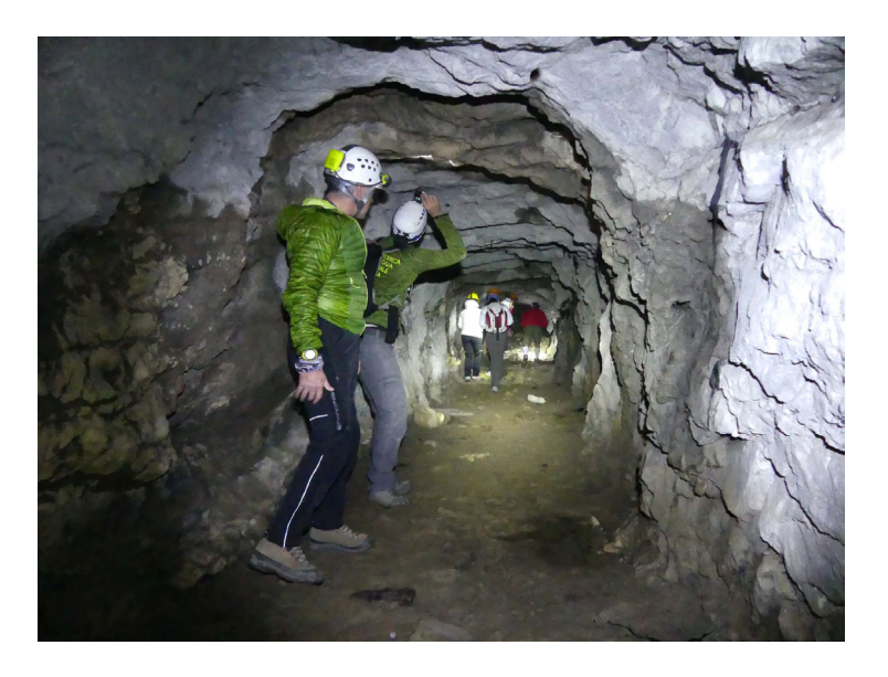
Fig. 5. Acquafredda mine (Roccamorice). The inside of the abandoned mine