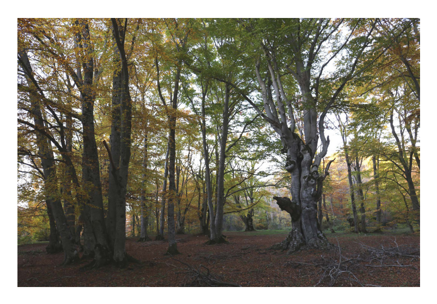
Fig. 9. Wood pasture known as Bosco di Sant'Antonio (Pescocostanzo). The most peculiar characteristic of the difesa system is its savanna-like physiognomy, with changing densities along a continuous tree cover and clearings between the trees